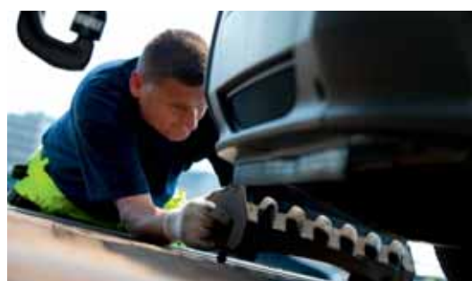
Securing cars on trains for onward transportation in Sweden