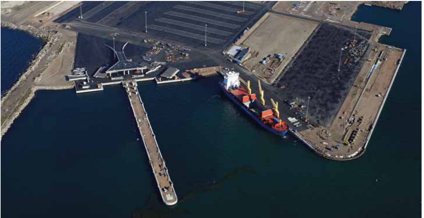
Part of Norra Hamnen where the RoRo ramp is under construction