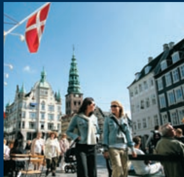
Strøget - Pedestrian shopping street