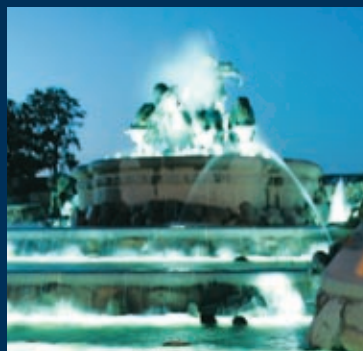
The Gefion Fountain