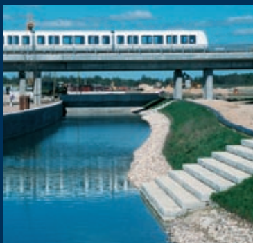
The Copenhagen Metro