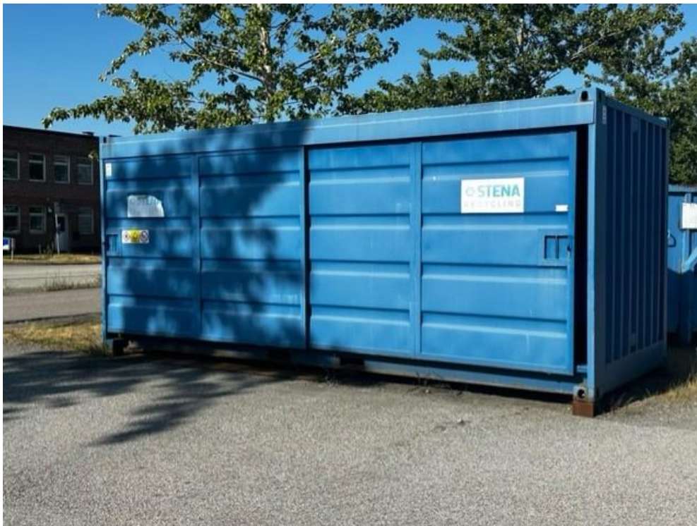
Figur 2: Fixed for merchant vessels.