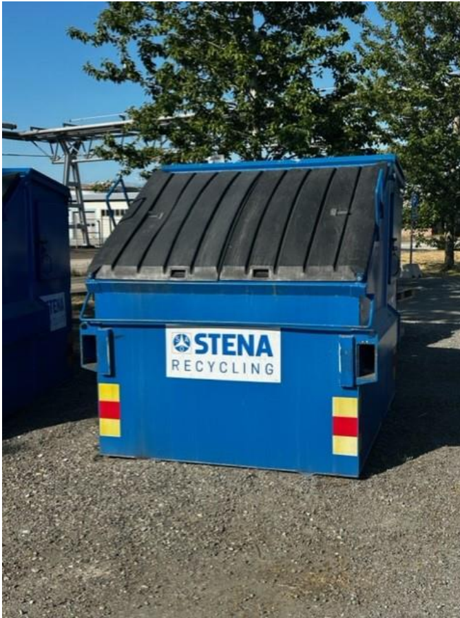
Figur 1: Seasonal for cruise vessels.